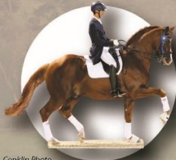
QREDIT Quarterback - Dream of Glory