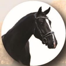
DENMARK HTF Desperado - Negro