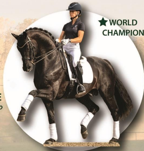
GLAMOURDALE Lord Leatherdale - Negro