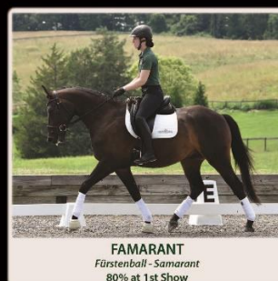
FAMARANT Fürstenball - Samarant 80% at 1st Show

Visit select sales horses online or call for information on others not yet listed.