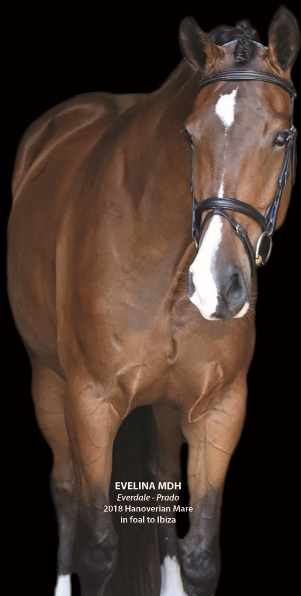
EVELINA MDH Everdale - Prado 2018 Hanoverian Mare in foal to Ibiza